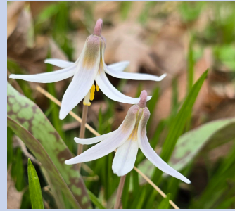
White Trout Lily