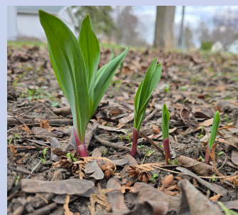
Ramps/ Wild Leaks